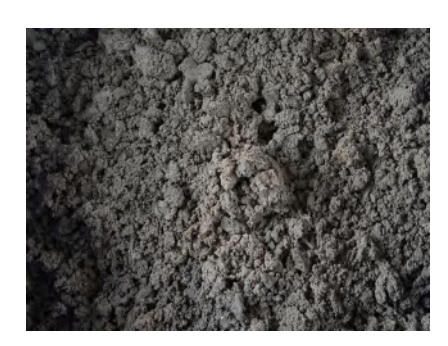
Municipal Sludge, Biochemical Sludge Drying