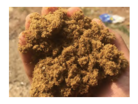
Fish meal, Meat Bone Meal, Feeds Drying