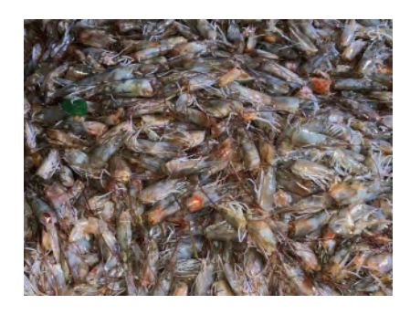
Water Product Scraps Drying